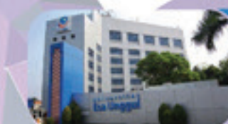
MAIN CAMPUS OF ESA UNGGUL UNIVERSITY KEBON JERUK, JAKARTA

"Taking double degree student was unplanned before. It was a chance at that time, and I was chosen to be one of them that flight to Nanjing, China. China teach and gave me a lot of new things. Simple example is when I can feel 4 seasons. When I back to Indonesia, all the best experiences make me want to be a good person in the future. And one of a lot of good benefits after back from China is I can work at foreign company in Indonesia because I have one plus value that is can speak chinese, even though a little."