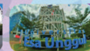
CITRA RAYA CAMPUS OF ESA UNGGUL UNIVERSITY TANGERANG