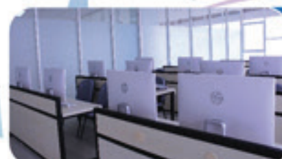
Computer Laboratory of International Campus UEU