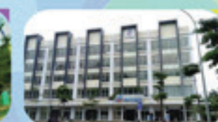
HARAPAN INDAH CAMPUS OF ESA UNGGUL UNIVERSITY BEKASI