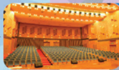
Concert Hall of JSNU